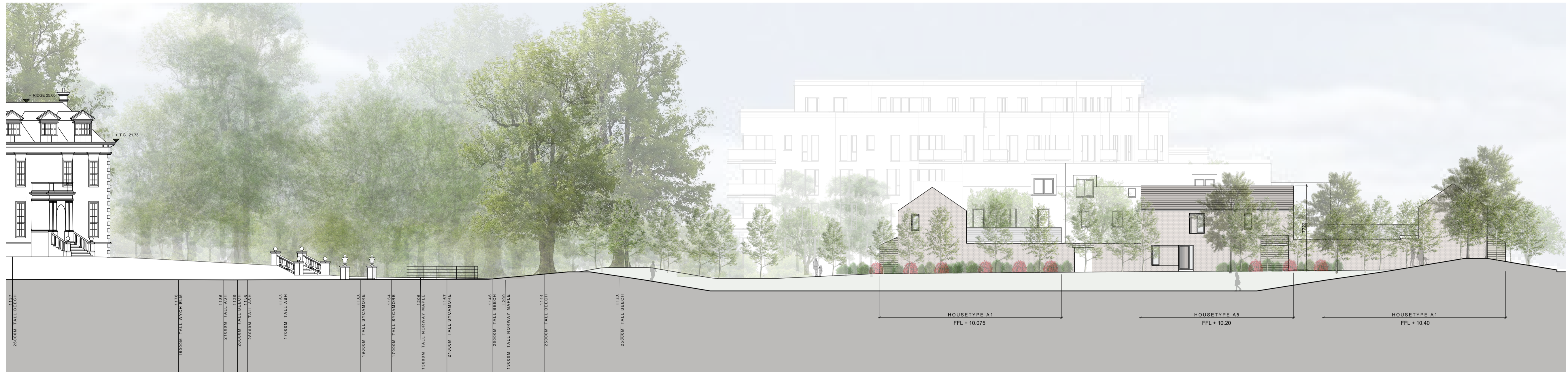
SITE SECTION Z1 - Z1 SCALE: 1:200 NOTE: SEE LANDSCAPE ARCHITECTS DRAWINGS FOR BOUNDARY TREATMENTS SEE ARBORISTS REPORT FOR DETAIL ON EXISTING TREES DOTTED RED LINE INDICATES SITE BOUNDARY